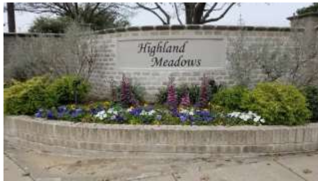
Highland Meadows & Pool Road (only 1 side of road is in our HOA)